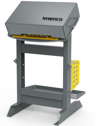
MO111212 With protection cover