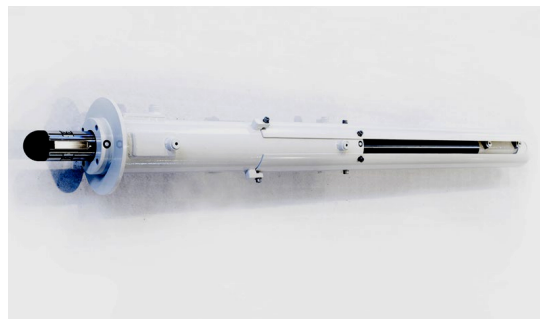
Piston rod with integrated locking dogs