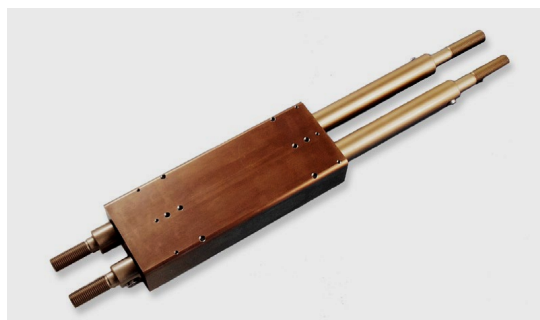
Dual cylinder in titanium and superduplex material