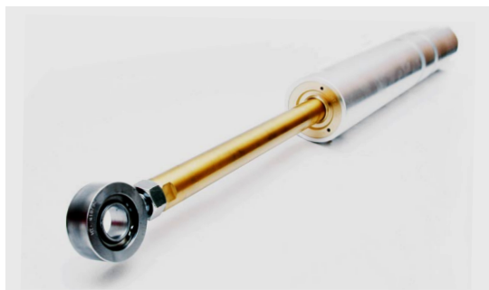
High pressure cylinder in titanium and superduplex material

All cylinders are designed, manufactured and documented in accordance to current regulations. Please contact Imenco for further information.